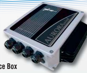
Wind Interface Box opzionale